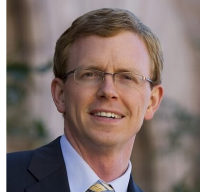
CONGRESSMAN DUSTY JOHNSON

United States Senate SD-511 Washington, DC 20510 Phone: 202.224.2321 Fax: 202.228.5429