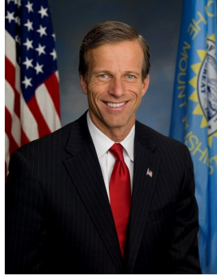
SENATOR JOHN THUNE

716 Hart Senate Office Building Washington DC 20510 Phone: 202.224.5842 Fax: 202.224.7482