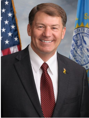
SENATOR MIKE ROUNDS